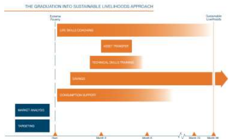
Figure 1: Core elements of the Graduation model